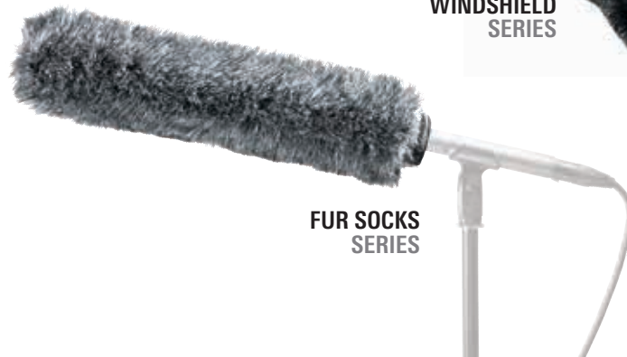
FUR SOCKS SERIES

Pull-on Fur Socks fit over an existing foam, windshield for enhanced windnoise protection.