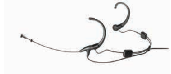
AT8464 Dual-ear Microphone Mount

Also terminated for Audio-Technica and other manufacturers' wireless systems.