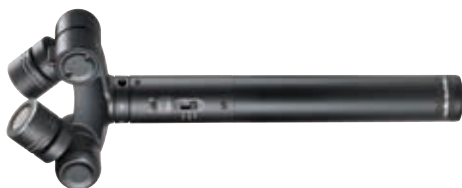
AT2022 X/Y Stereo Microphone