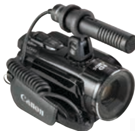
PR024-CMF Stereo Condenser Microphone

included accessories: AT8405a stand clamp for 5/8"-27 threaded stands; cable; fuzzy windscreen; battery; soft protective pouch.