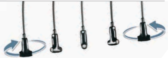
Innovative rotating capsule housing

included accessories: AT8539 power module (wired only); AT8464 dual-ear microphone mount; AT8440 cable clip; two AT8163 windscreens; moisture guard; belt clip (wired only); carrying case.