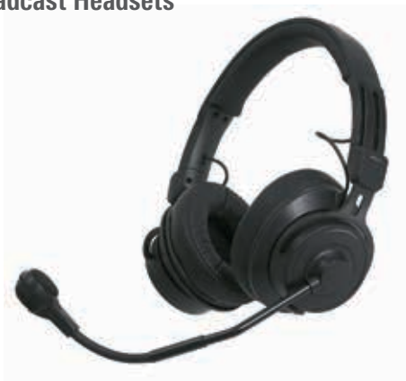
BPHS2 (with unterminated cable BPHS2-UT ) Broadcast Stereo Headset with dynamic microphone