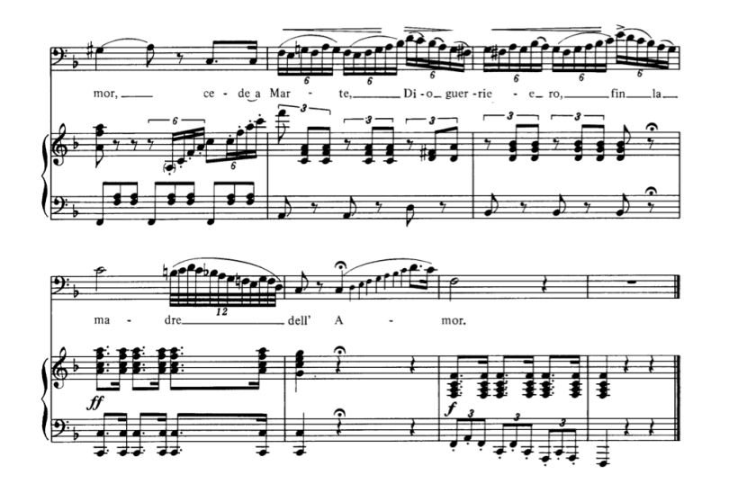
Figure 2: Score for soloist and piano accompaniment of the final of the first Donizetti's excerpt: agilities of the soloist on the larghetto reprise and final cadenza ("A-mor").

few woodwinds and a harp. The recording includes the initial clusters for strings and brasses, which may be useful in some listening tests (see Fig. 3).