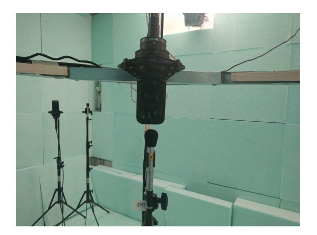
Figure 5: Detail with one of the B&K 4190 microphones used as reference and one of the recording microphones AT 4050.

Hidaka et al. used several small diaphragm mics: B&K 4003 (omni), B&K 4006 (omni) and Schoeps for the main, as a spot Schoeps for woodwinds and strings, Neumann SM-81 for brasses and AKG C451E for percussions. Hansen and Munch both cardioid (Sennheiser MKH40, B&K 4011, Schoeps MK4) and omnidirectional (B&K 4003), depending on the environment. Vigeant et al. used small diaphragm DPA 4006 omnidirectional. Patynen et al. used large diaphragm Rode NT1 [8].