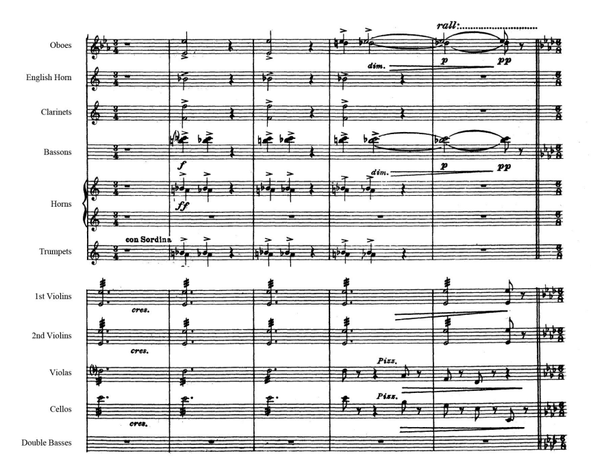
Figure 3: Score of the initial part of third excerpt ( Gianni Schicchi , last five bars of 39), with orchestral clusters.

The recording room was the listening room of the University of Bologna. The faint reverberation at low frequencies (see fig. 4(b)) was not considered as a problem, since the decay time of the instruments which produce fundamental frequencies below 150 Hz.