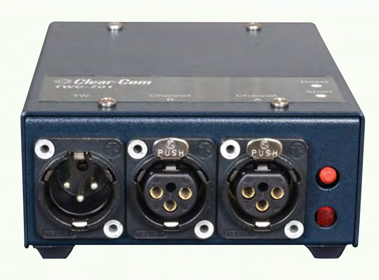
TWC-701 Front panel