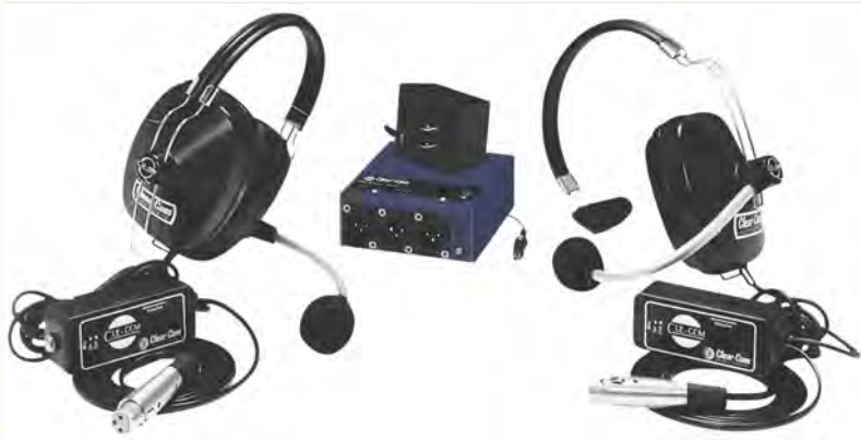
Que Comm Single-Channel Intercom System

Que-Com intercom systems are a compact, cost-effective, portable solution to many intercommunications needs. It consists of a PK-7 intercom power supply, and a choice of either one-ear (SMQ-1) or two-ear (DMQ-2) headset stations with an integral boom mic, attached to a rugged beltpack housing the electronics. Que-Com systems are compatible with all other Clear-Com party-line intercom products.