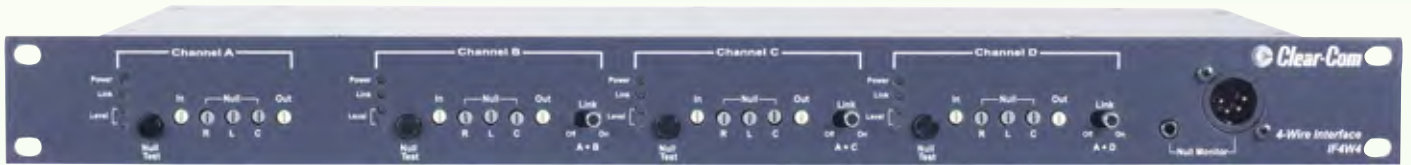
IF4W4 front view

The IF4W4 modular 4-wire interface connects camera intercoms, two-way radios, fiber optics, and other 4-wire devices to a standard Clear-Com intercom line. The 1-RU chassis holds up to four individual interface modules, each with its own 4-wire terminal block and XLR-3M connector to interface with Clear-Com.