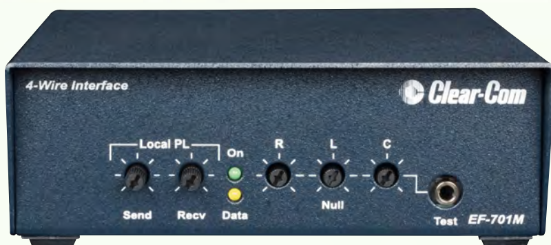
EF-701M Front Panel

The EF-701M interface converts a single channel of standard or TW party line intercom to four-wire audio, while also converting call signals to RS-422 data (and back). The resulting four-wire audio plus RS-422 data can then be sent to a Clear-Com Matrix port, fiber-optic converter (modem) or connected to another EF-701M over twisted-pair cable such as CAT-5E. When used with a Matrix system, the EF-701M allows a party-line channel to be connected to the frame with up to 5000' of cable. With its excellent hybrid null and wide-range level controls the unit may also be used as a best-quality stand-alone two-to-four-wire converter.