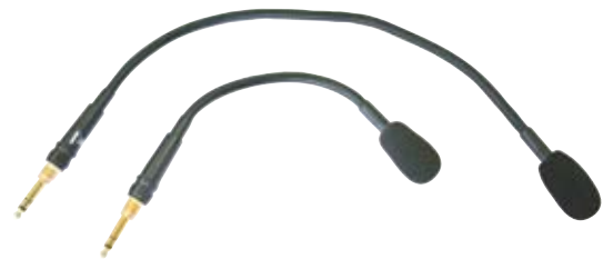
GN-250 / GN-450