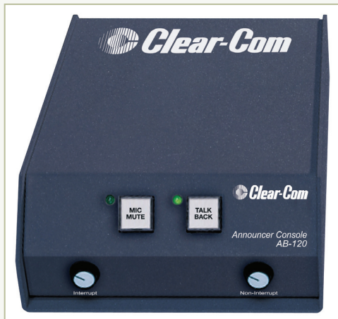
AB-120 Announcer Console