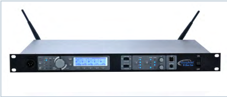
CM-244 4-Channel Tempest Wireless BaseStation