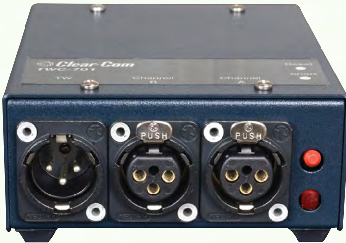
TWC-701 Front panel