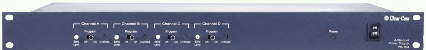
PS-704 Front Panel

The PS-704 is a four-channel, single-rack-space intercom power supply that features Clear-Com's "fail-safe" design for maximum reliability. The power supply delivers 2 amps at 30 volts, supplying power for one to four channels of intercom. It will support up to 40 belt packs, 10 speaker stations or 12 headset stations.